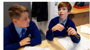
Encourage your children to speak in full sentences, using mathematical vocabulary