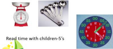
Read time with children-5's

Cook with your children-count measurements and read scales